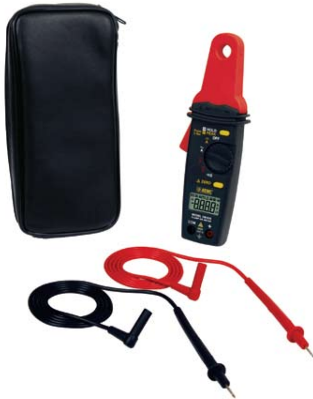
Model CM605 includes test leads, soft carrying case, 2 1.5V AAA and user manual.