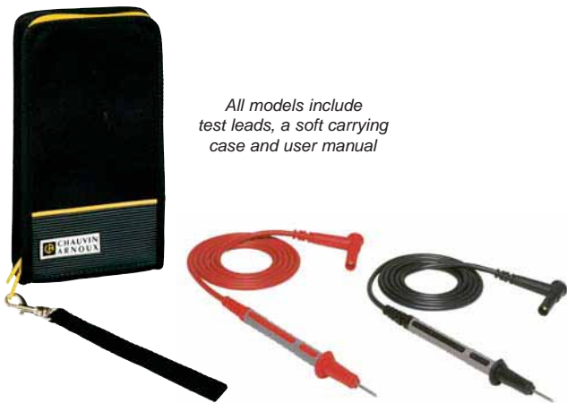
All models include test leads, a soft carrying case and user manual