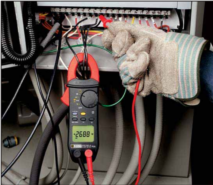
Model F05 monitoring volts, amps and watts on a control panel.