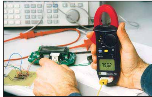
Model F03 measuring temperature on electronic circuit board using a K thermocouple.